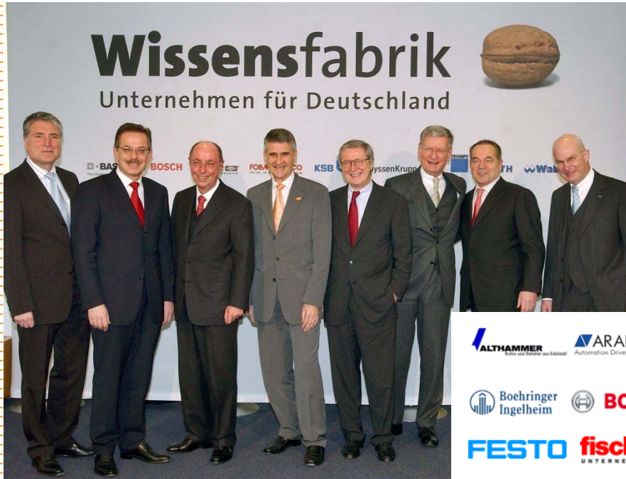
Nine founding member in January 2005